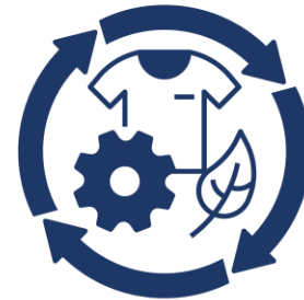
Transformation into circular processing