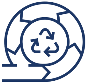
Circular business models