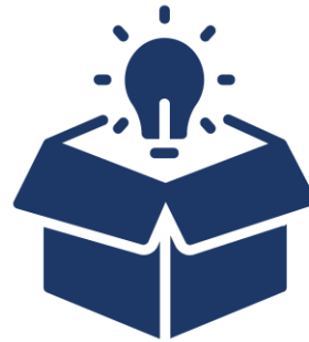
Circular products design